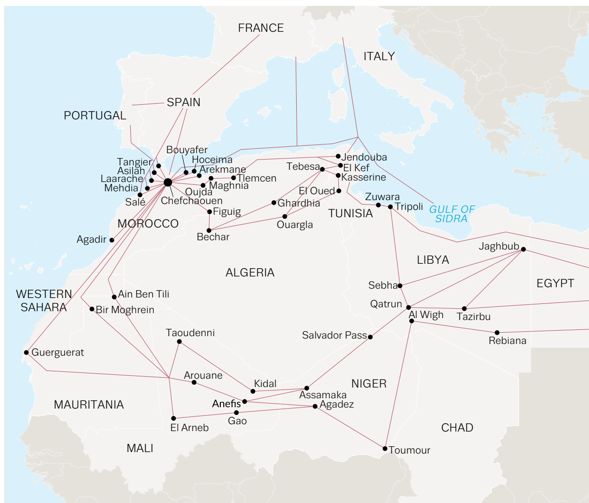
FIGURE 3 Cannabis trafficking routes in North Africa

Cannabis resin produced in Morocco may also transit overland across the Sahel towards Libya (Figure 3). However, this route is thought to have become less attractive to traffickers in 2020 and 2021. Increased tension between the Polisario Front (Frente Popular para la Liberación de Saguía el-Hamra y Río de Oro) and the Moroccan government led to impediments in movement, and the coup d'état in Mali appears to have disrupted established relations between security actors and traffickers and led to a surge in seizures, impacting the volume of resin trafficked along this route (Herbert and Fereday, 2021; UN, 2021).