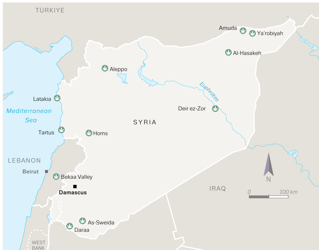
FIGURE 2 Cannabis cultivation in Syria and Lebanon

cultivation was reported throughout the northeast, northwest, southwest and centre of Syria, both in areas under government control and those held by various anti-regime armed groups (Syrian Observatory for Human Rights, 2021a, 2021b, 2021c).