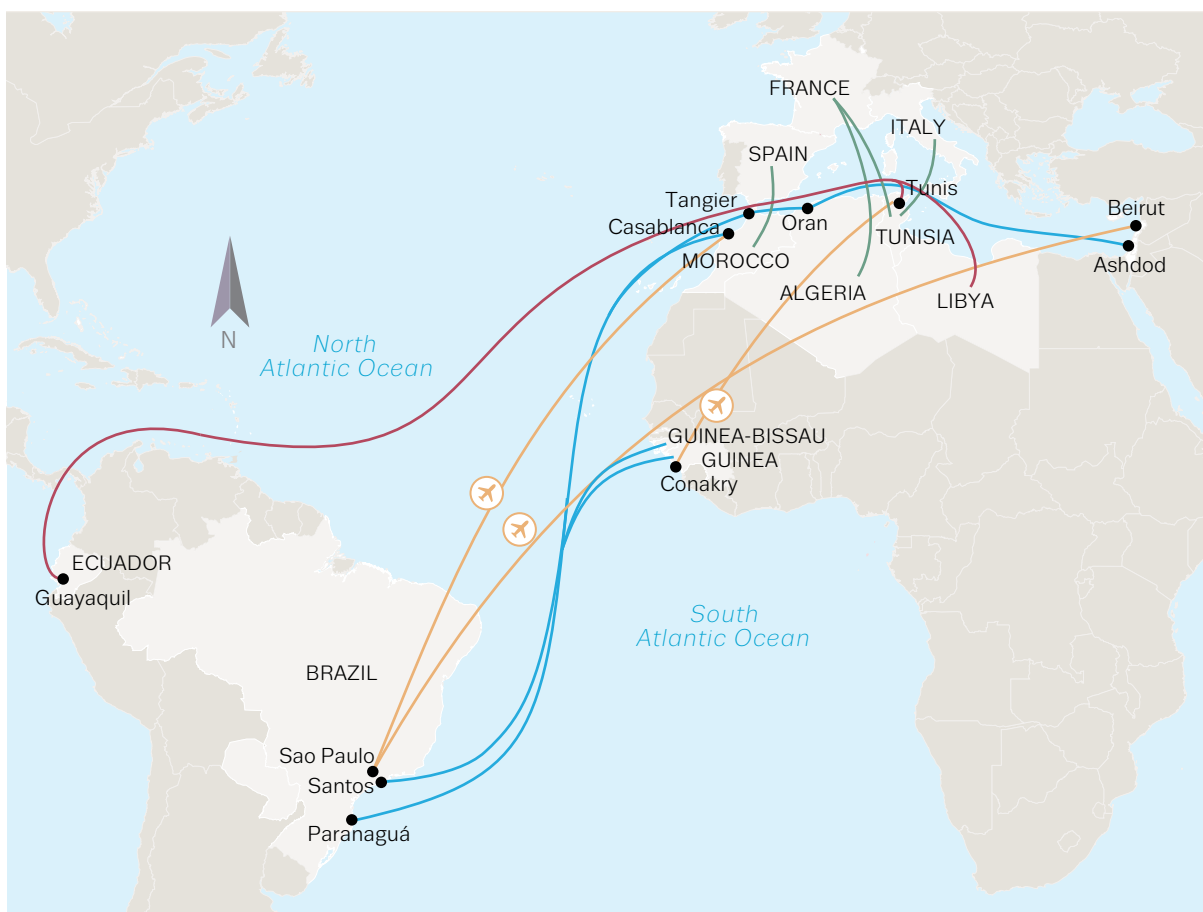
FIGURE 7 Cocaine trafficking routes from South America to North Africa

Most cocaine trafficked into the region comes directly from South America, or from South America through West Africa (Figure 7). Once in the region, most cocaine is thought to move along the coast, shuttled from point to point by smaller craft, primarily fishing vessels, although some is also probably trafficked overland, along similar routes described in the cannabis section above (Herbert and Gallien, 2020a; Jewish News Syndicate, 2021; The Times of Israel, 2021). On the roads, there is some transportation from Algeria into Tunisia and Tunisia to Libya, but the volumes appear to be relatively small. Because of the closed border between Algeria and Morocco, legal crossings by road are not possible there, but small volumes are trafficked clandestinely across the border, likely by the cannabis resin trafficking networks which operate between the two countries. While