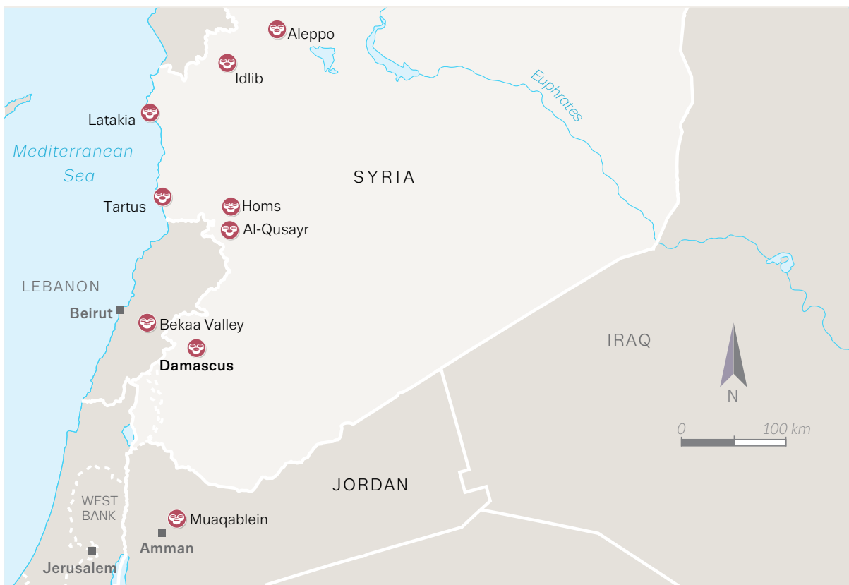
FIGURE 5 Captagon production in Syria and neighbouring countries

It is possible that, from 2011 onwards, the conflict in Syria had an impact on captagon production, although this is difficult to substantiate empirically. However, the combination of weak jurisdiction, increased demand by combatants or conflict-affected populations, and various factions seeking to generate funds may all have resulted in a greater incentive to increase production of captagon (EMCDDA and Europol, 2016; GI-TOC, 2016; Rose and Soderholm, 2022). There are also signals from non-public sources that production of captagon in the country has increased, possibly substantially, in recent years with the