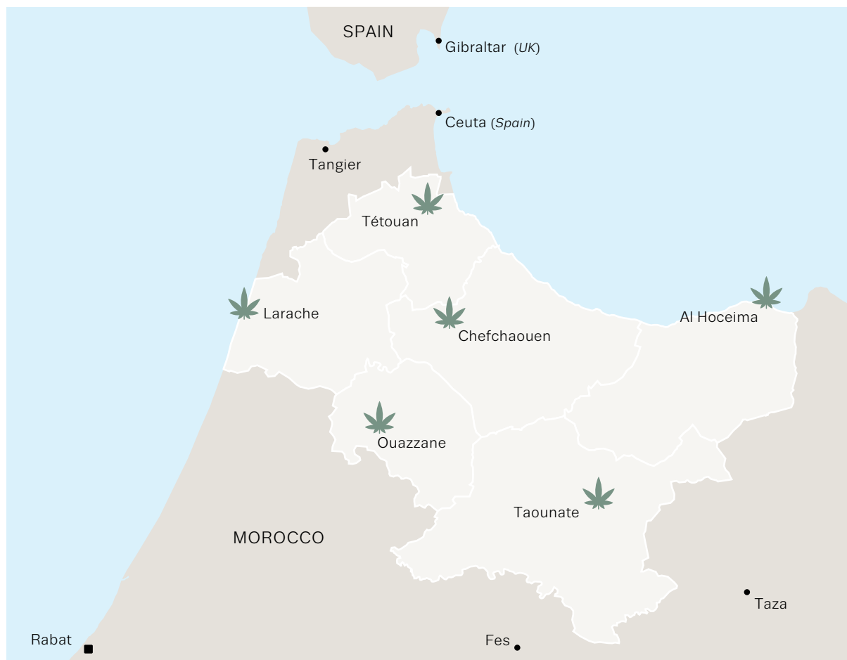
FIGURE 1 Cannabis cultivation areas in Morocco

Morocco appears to have the largest area for cultivation of illicit cannabis in the region (Figure 1). However, official reports point to a long-term reduction in the area under cultivation. In 2019, the most recent year for which official data were available, Moroccan farmers were estimated to cultivate around 21 000 hectares of cannabis, down from 47 500 hectares in 2017 (UNODC, 2021a). However, this