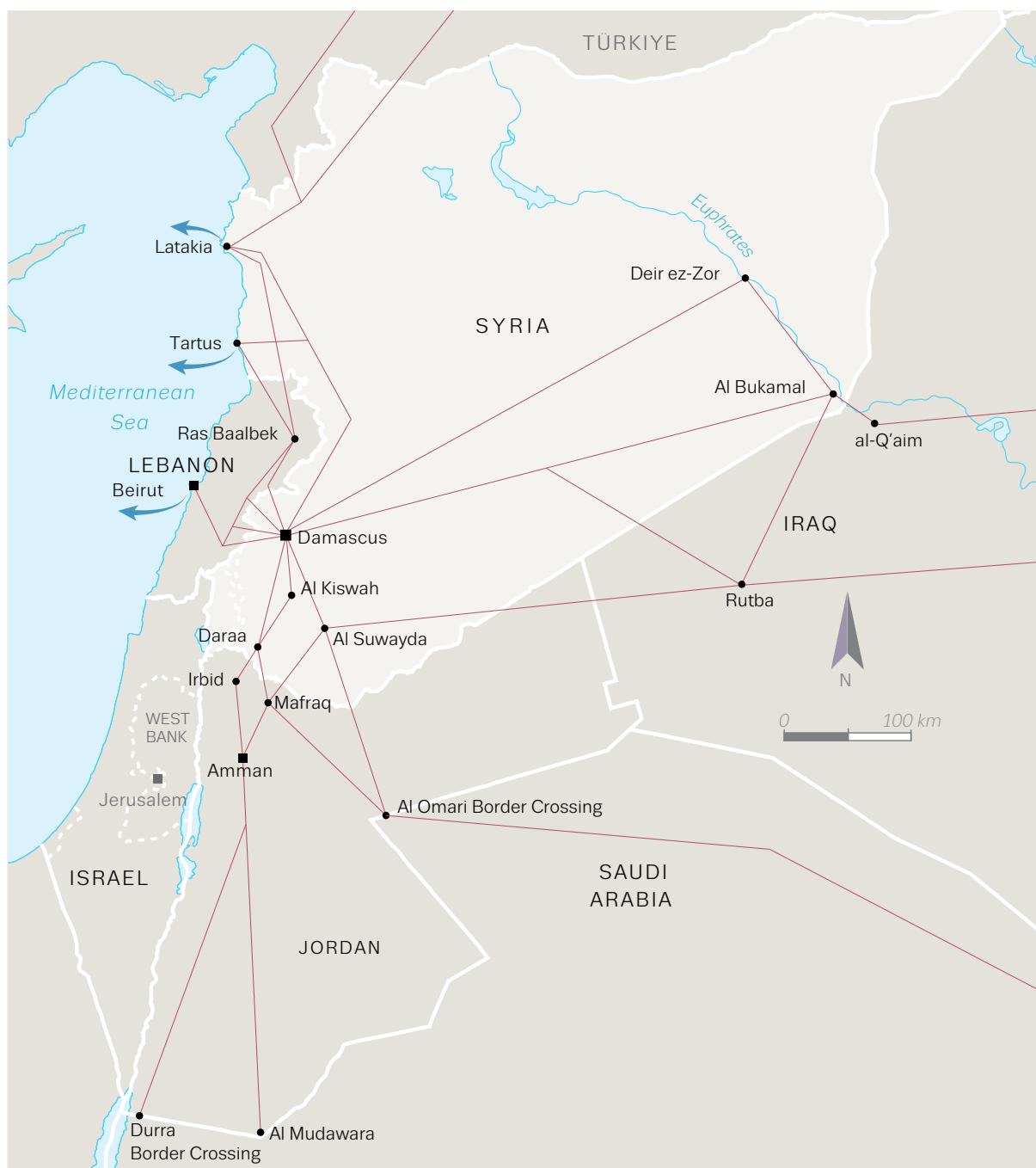
FIGURE 6 Major captagon trafficking routes in Syria and neighbouring countries

There are some indications of captagon trafficking in other regions. Some reports suggest that Lebanese traffickers may be using West Africa as a transit location for captagon shipments. In January 2022, 12 tonnes was shipped in boxes of powdered juice to Sudan. In the same month, a substantial quantity of captagon tablets was hidden and mixed in tea boxes destined initially for Togo (Houssari, 2022). Given the fragility of the states in these regions and the historical cross-Sahel trafficking of Moroccan cannabis, the use of this route could increase in the near