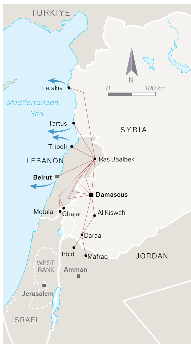
FIGURE 4 Cannabis trafficking routes in Lebanon, Jordan and Syria

Trafficking routes originating in cultivation zones in Lebanon and Syria appear equally diverse (Figure 4). One