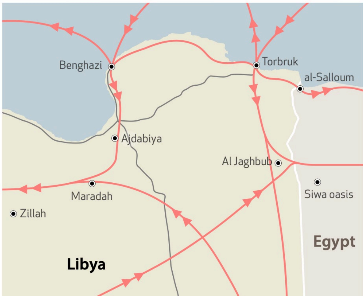
Map 3: Indicative drug smuggling routes on Libya's east coast, based on data collected by the Global Initiative Against Transnational Organized Crime. There is an overlap with similar routes used to smuggle different types of drugs and prescription medicines.

Crucially, there is also evidence that the east of Libya is becoming a more important target zone for cocaine shipments, sometimes linking the region directly with South American drugs trafficking. For instance, in July 2018, Colombian national police seized 43 kg of cocaine in the port of Buenaventura that were hidden in the structure of a container to be shipped to Benghazi (46) . In October, anti-drugs police found 17 kg of high-purity cocaine destined for Benghazi from the Gioia Tauro container port in Calabria, southern Italy (47) . Two years earlier, fishermen found 70 kg of cocaine on a beach 40 km west of Tobruk (48) .