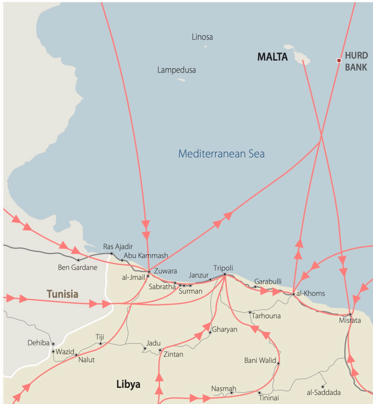
Map 1: Indicative drug smuggling routes in Libya's coastal west, based on data collected by the Global Initiative Against Transnational Organized Crime. There is an overlap with similar routes used to smuggle different types of drugs. However, inside Libya, the trafficking of cocaine and heroin is considered a top-tier activity that normally involves specialised criminal actors.